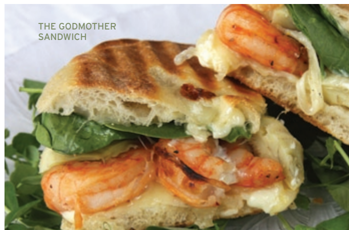
THE GODMOTHER SANDWICH